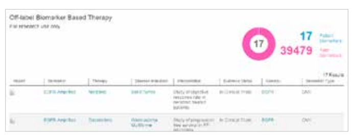
Figure 3: BaseSpace Analyzer Research Reports