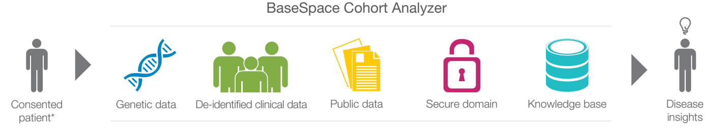
Report | Curate | Aggregate | Analyze