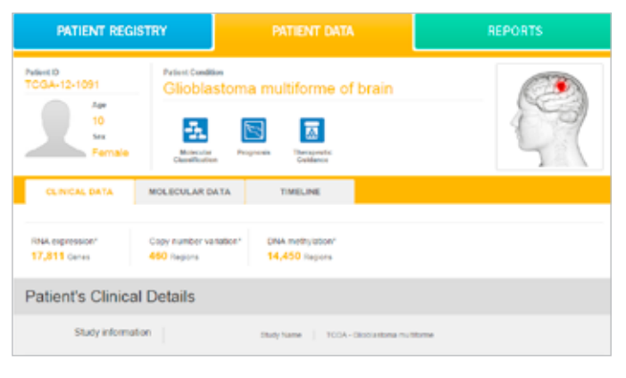
Figure 2: BaseSpace Analyzer De-Identified Patient Data